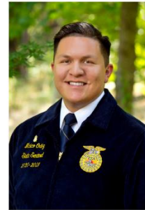
"A Place for All"