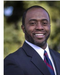
Superintendent of Public Instruction