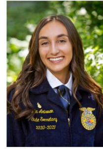
"Courageous, Contagious Curiosity"