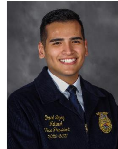
National FFA Western Region Vice President