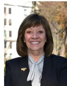
Secretary of Food and Agriculture