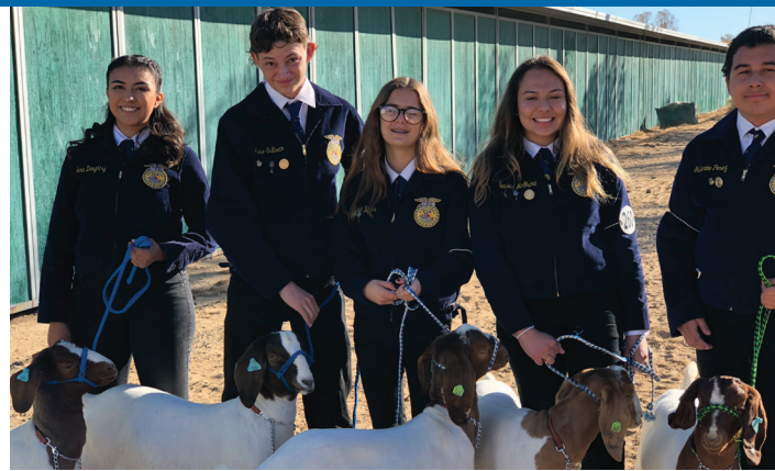
Photo Captions (starting opposite page, upper left, rotating clockwise): Lone Pine members attend the 2018 State Conference in Anaheim; chapter officers celebrate new members at a back to school BBQ; Kern County Fair goat show exhibitors; chapter members attending the National FFA Convention visit the Indy 500 Speedway; chapter members celebrate FFA week with a fun day of games; 2018-19 chapter officers at the school farm; officers attend San Joaquin Regional Boot Camp to improve their leadership skills for their chapter; members serve at our Blue and Gold Fundraiser; and 2018 beef show team.

Whitney, view the movie locations in the Alabama Hills, or drive up Highway 395 to Mammoth Mountain, turn East on Muir Street - we would love to have you stop by!