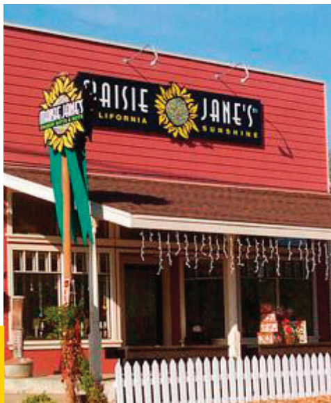
In addition to the online store, Maisie Jane's has a storefront located in Chico. She feels blessed by all the support the community has given her company through the years.