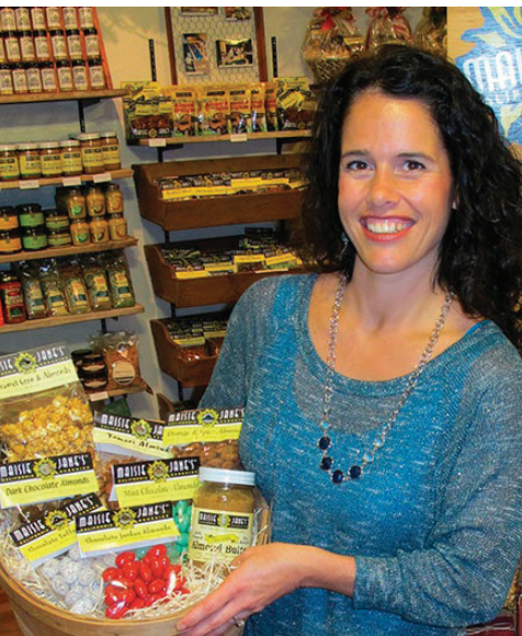
Maisie Jane's offers an online store where you will find our top-quality nut products and unique gift baskets for every occasion.

for any young person interested in agriculture, the best thing is to learn by experiencing it - offering your time for internships. The most valuable learning experiences are being hands-on." •