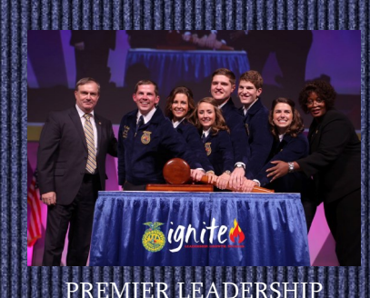
SESSIONS & SPEAKERS LEADERSHIP WORKSHOPS